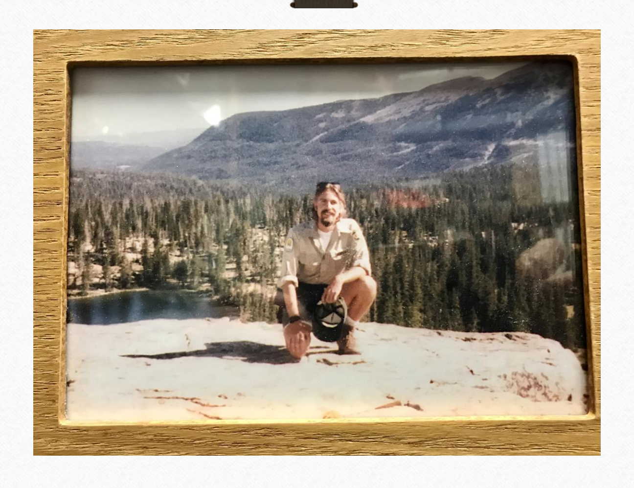
1994 – Forest Service Volunteer